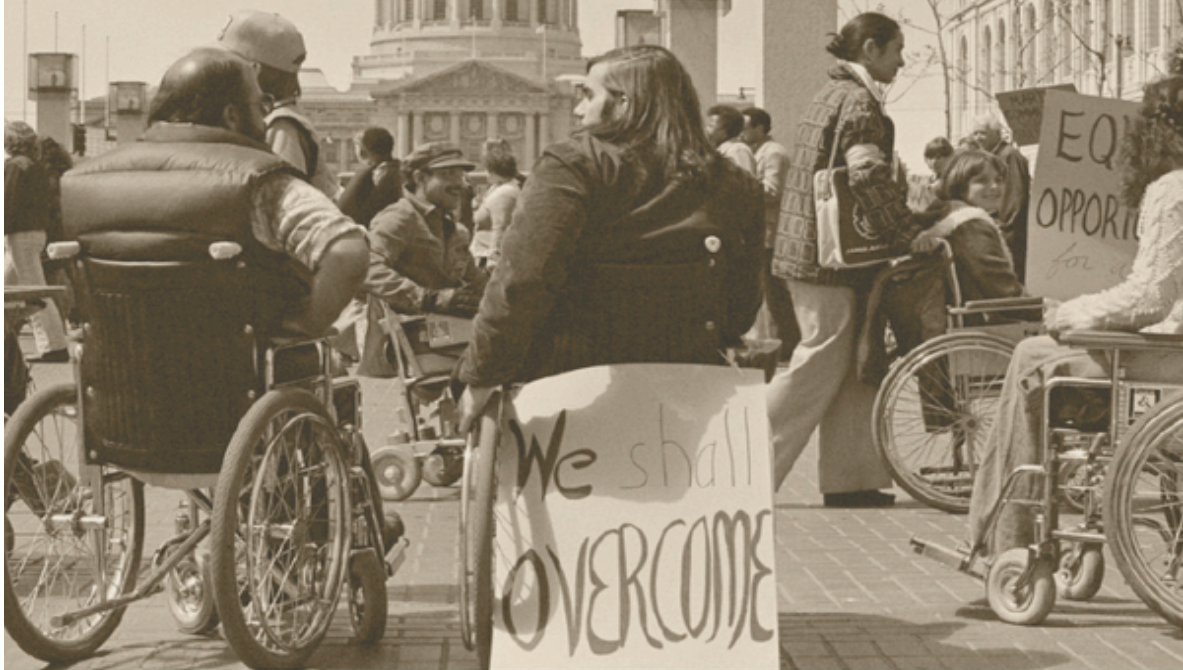
EXHIBIT GRAND OPENING

PEOPLE WITH DISABILITIES SECURING CIVIL RIGHTS