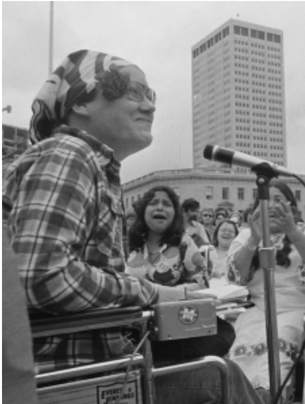
Photograph courtesy of San Francisco Examiner Archive, Bancroft Library, University of California, Berkeley, April 1977

WE PROUDLY DEDICATE THE "PATIENT NO MORE" EXHIBIT To: THE PARTICIPANTS OF THE 504 OCCUPATION IN APRIL 1977 AND IN MEMORY OF ORGANIZER KITTY CONE (1944-2015)